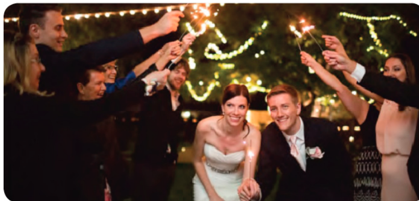
The Magical Lindon House Lighting