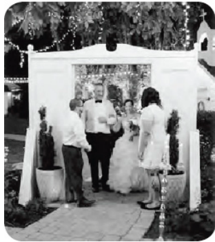
French Doors provide a dramatic entrance