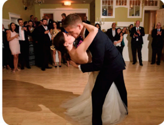
Indoor dance and multipurpose room