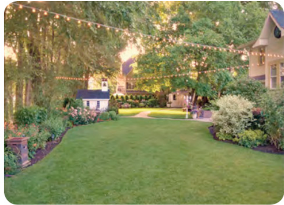
Ceremony and Banquet site in the shade of the back trees